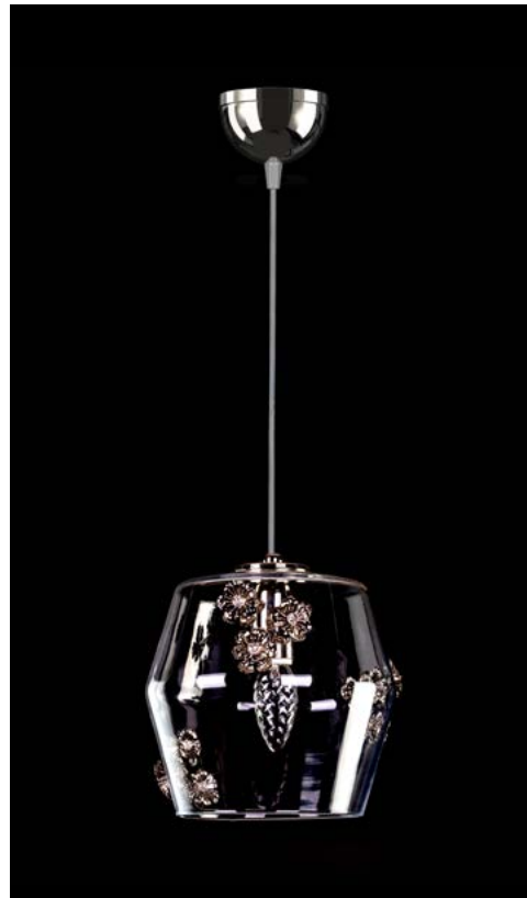
PRIMAVERA 04-CH-NA-CE 200 x H 200 (TH 1000) mm | 1 x E14