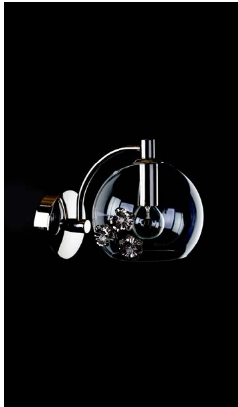
PRIMAVERA 01-WL-NA-CE W 150 x D 220 x H 170 mm | 1 x E14