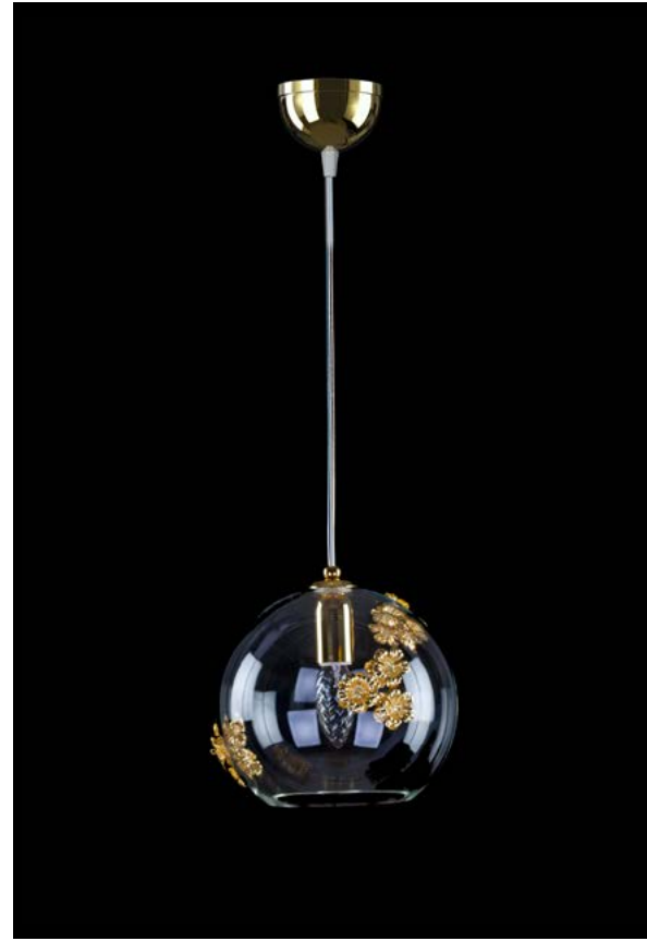
PRIMAVERA 02-CH-PB-CE Ø 200 x H 200 (TH 1000) mm | 1 x E14