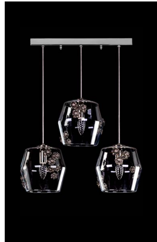
PRIMAVERA 07-CH-NA-CE W 500 x D 200 x H 450 (TH 1500 mm) | 3 x E14