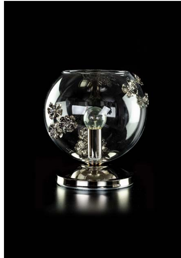
PRIMAVERA 01-TL-NA-CE Ø 200 x H 220 mm | 1 x E14