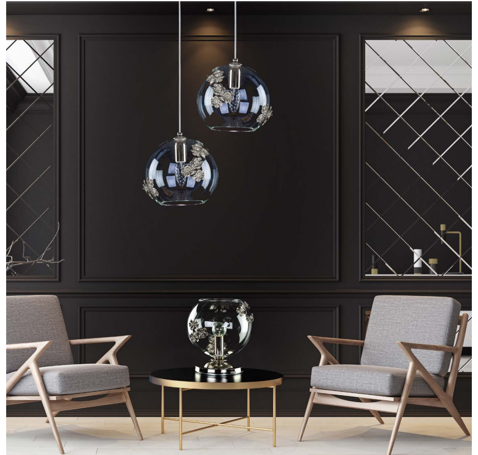
2x PRIMAVERA 02-CH-NI-CE