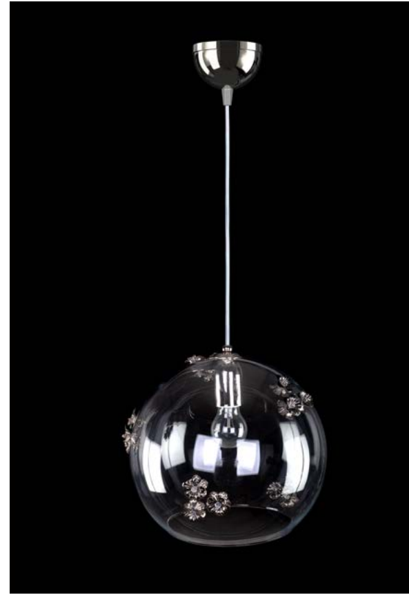
PRIMAVERA 03-CH-NA-CE Ø 300 x H 300 (TH 1000) mm | 1 x E27