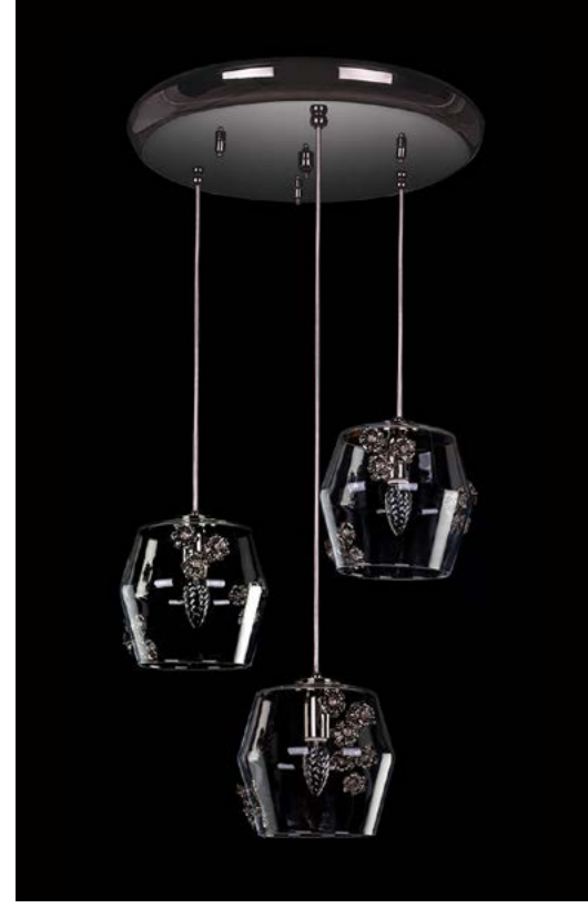
PRIMAVERA 06-CH-NA-CE Ø 350 x H 550 (TH 1000) mm | 3 x E14