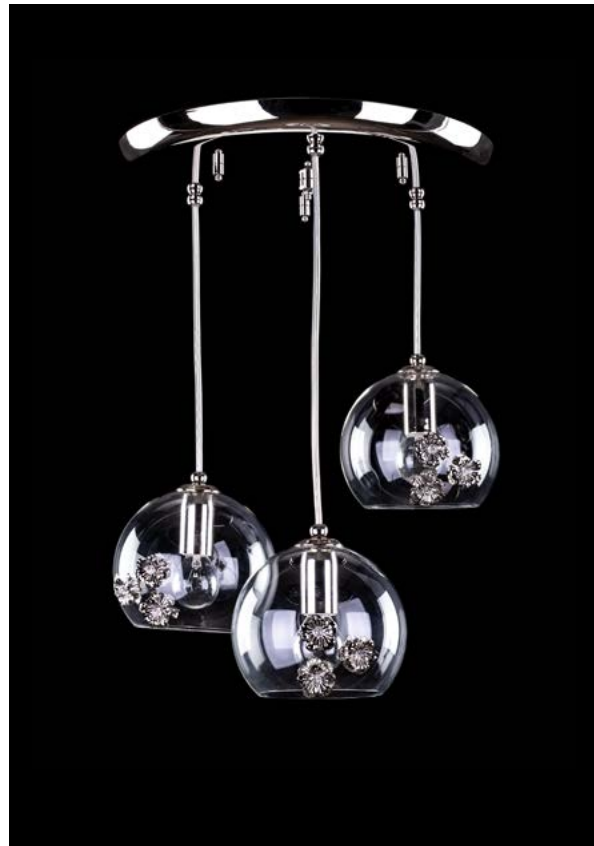
PRIMAVERA 05-CH-NA-CE Ø 340 x H 550 (TH 1000) mm | 3 x E14