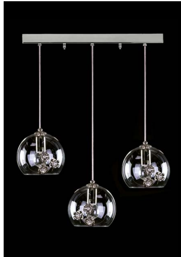
PRIMAVERA 08-CH-NA-CE W 500 x D 150 x H 550 (TH 1500) mm | 3 x E14