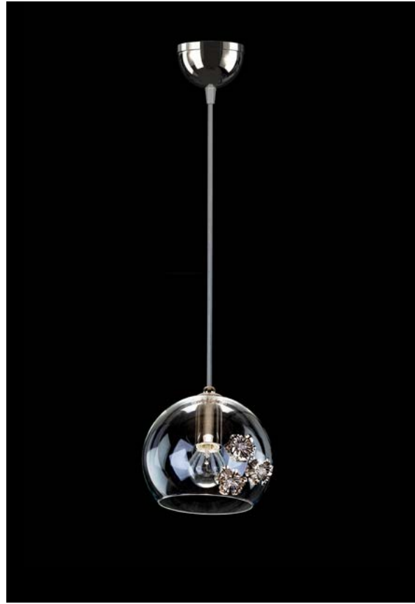
PRIMAVERA 01-CH-NA-CE Ø 150 x H 150 (TH 1000) mm | 1 x E14